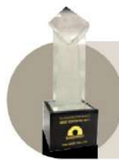
Best Export Award 2023