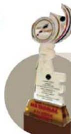
National Award 2009