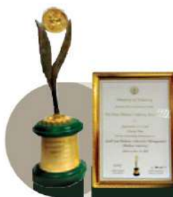
Prime Minister Award 2020