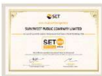
SET ESG RATINGS 2024 "BBB"